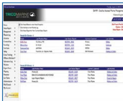
SAMM - Shore