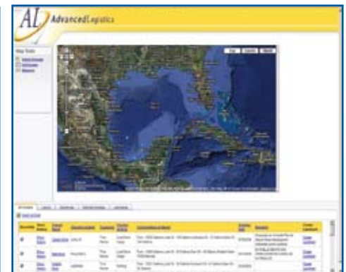
SAMM - Shore - Mapping